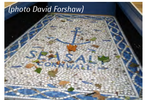
Autumn approaches as the falling leaves litter the new Sea Salt mosaic at the entrance to the new store in the former kitchen shop in Market Square.

add the ambience so vital to one of the best small towns in the country according to Bill Bryson. We have also attracted recently national brands like Gusto and Fat Face and of course our latest Sea Salt. It is this I would like to highlight as the way to approach the setting up of a new business venture by finding out about the town you are moving into. They have