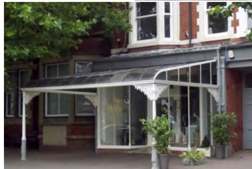
A traditional looking veranda in Clifton Street at Chell's Café next to the Institute

add the ambience so vital to one of the best small towns in the country according to Bill Bryson. We have also attracted recently national brands like Gusto and Fat Face and of course our latest Sea Salt. It is this I would like to highlight as the way to approach the setting up of a new business venture by finding out about the town you are moving into. They have