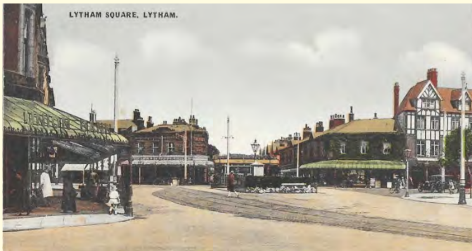
An old postcard of Lytham Square (Clifton Square) c1903 with shop verandas and tram tracks. The poles are going up in readiness for the electrification of the tramway system which dates the scene. Verandas and canopies are a subject very much in the thoughts of many people over 100 years later.

As this is the last Antiquarian before January 2019, may the Committee and I wish you all