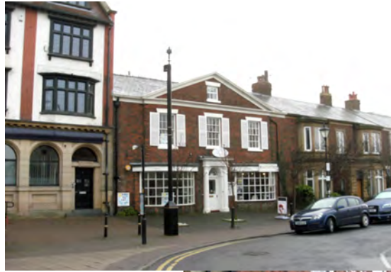
7 Dicconson Terrace (SPARGO) before and now

Let me finish on a positive note. We are very lucky in Lytham to still have our department store which appears to be doing well with the building work currently underway. In addition we have lots of local businesses offering a wide range of items making our town centre a thriving one. The cafés and restaurants