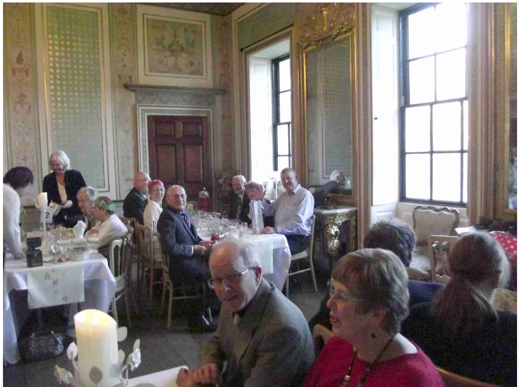
Members enjoying the Christmas meal in the Gold Room at Lytham Hall