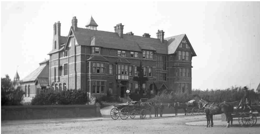
The first St ANNES HOTEL